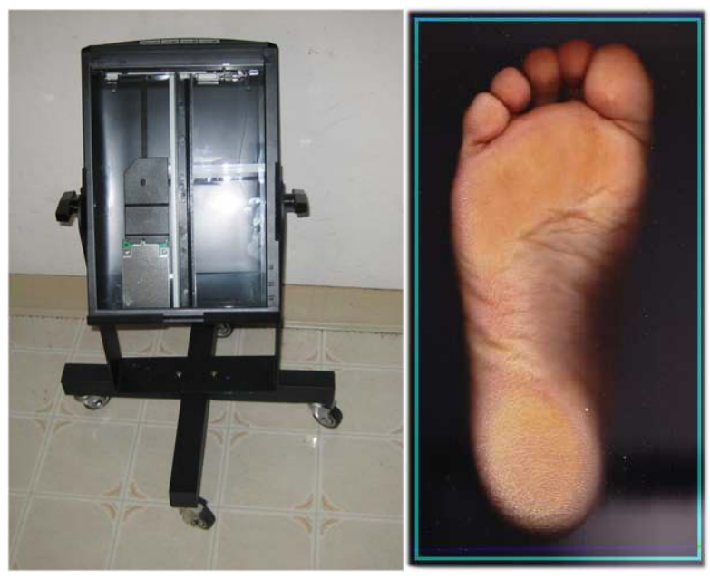
Figure 1: 2D Foot Scanner and Foot Image

Although we did some R&D work in the 2D-to-3D field many years ago, we terminated the work because of unsatisfactory results. The advances of technology in recent years gave us the tools to tackle this issue from a different angle. After our recent hard work, we feel that we can present a much better program to the market. Producing carved orthoses from 2D scanners has now become more possible. Still, this is the beginning of a new era and more tests are needed.